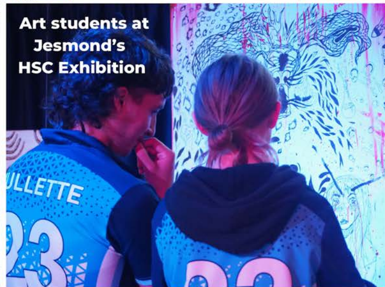
Art students at Jesmond's HSC Exhibition