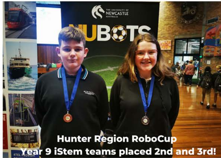
Hunter Region RoboCup Year 9 iStem teams placed 2nd and 3rd!