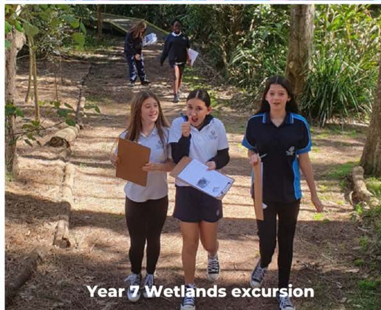
Year 7 Wetlands excursion

As well as the everyday learning on Campus, students have had a busy term with various excursions. These included competing against Hunter students in Science and iStem competitions at the University of Newcastle, CAPA Showcase, Year 10 Subject Selection Interviews for Year 11 at Jesmond Senior Campus in 2024 and with beautiful weather, a Year 7 excursion to our local Wetlands.