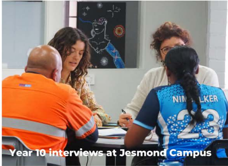
Year 10 interviews at Jesmond Campus