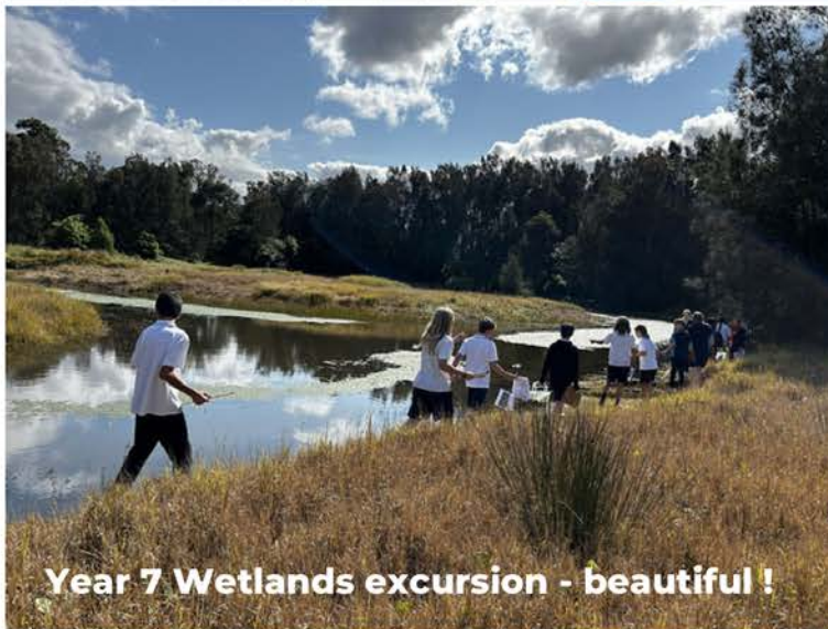
Year 7 Wetlands excursion - beautiful !