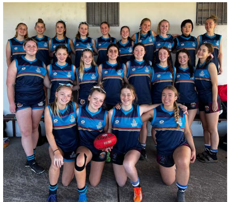
Wallsend's Girls AFL team competing in the Swans Shield Gala Day, shmick in their new uniforms.