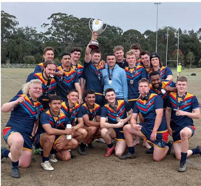
Our College Rugby League team won the NSW Schoolboy grand final this week at Central Coast Sporting Complex.