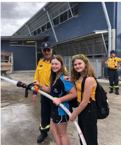
Thanks to Fire Control & Tilgerry Team for coming to our campus this term! Amazing, vital people!