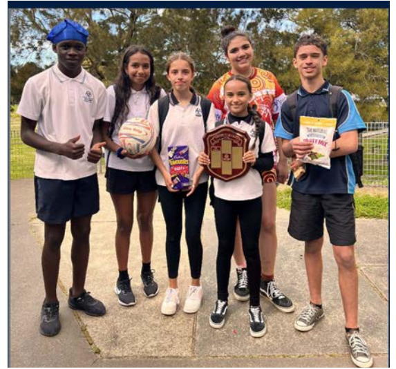
2022 Mixed Netball champions competition won by the Giants!!