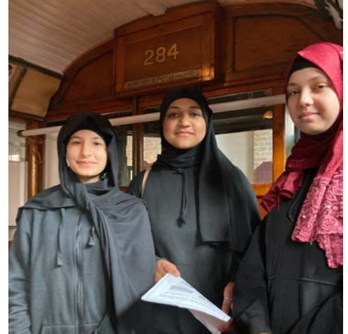
EAL/D cultural & historical excursion around Newcastle.