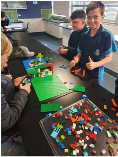
Year 7 Curious Creations students happily taking on the Lego Masters Challenge.