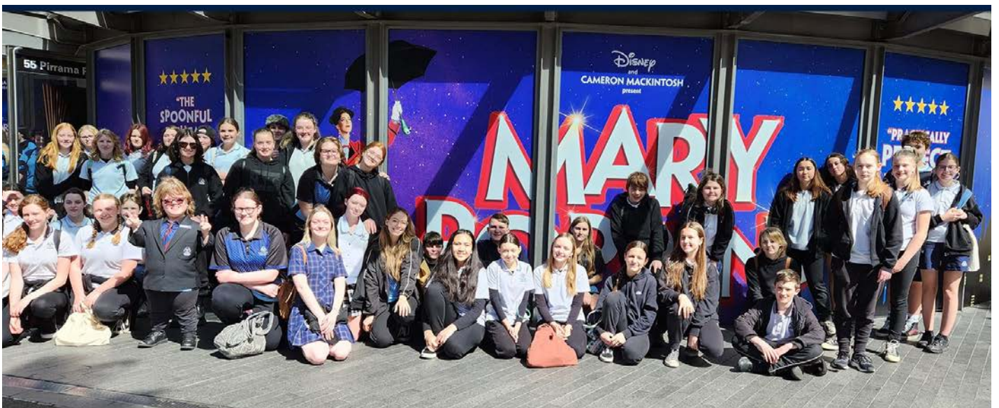
Fantastic excursion to see Mary Poppins in Sydney at the Lyric Theatre.