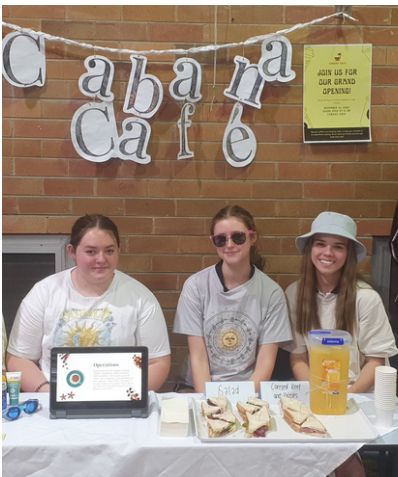
Year 10 students at their trade display as part of Australian Business Week program (ABW)