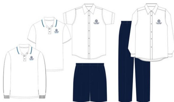
Boys everyday uniform options