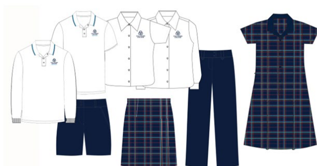
Girls everyday uniform options