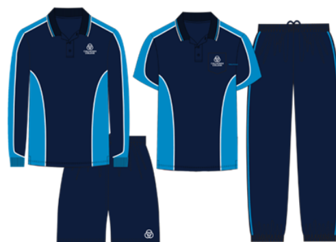
Unisex sports uniform options